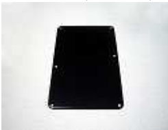
P-103 W (87x138)