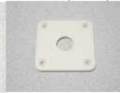
P-100 IV (34x34)