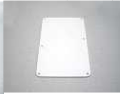
P-103 BMAT(87x138 P-104 B (87x138, P10.5)